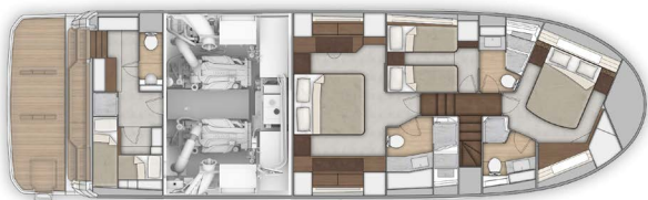
Lower deck - 3 Cabins