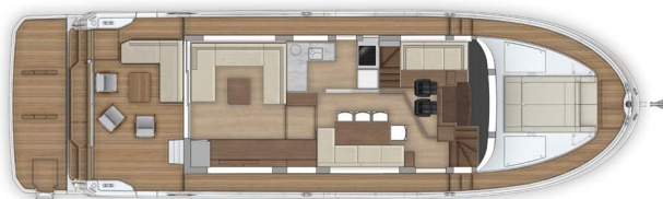
Main deck - 2 pilote seats