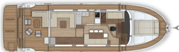
Main deck - 1 pilote seat